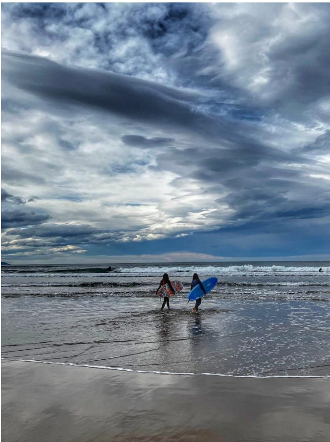
Typical afternoon at „Playa de Sopelana“

Outside of my internship, I had another “bubble” of Erasmus students. We created our own small community with similar hobbies, mindsets, and energy. With them, life was full of sports, sunset picnics, hiking, and spontaneous surf trips. We spent our free time exploring the beautiful north of Spain, which offers stunning mountains, beaches, cliffs, and incredible views. It was a great place for all outdoor activities, you’ll never run out of things to do. Every day or weekend turned into a new adventure. Getting around was super easy. Public transport was affordable, and with a simple transport card I could reach beaches and different neighbourhoods for just a few cents. For longer trips, car rentals were surprisingly cheap.