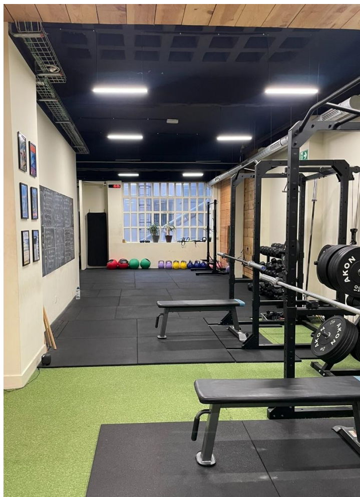
My workspace - moveBilbao

The biggest challenge was definitely working in a new language and stepping outside my comfort zone daily. Thanks to the supportive and open atmosphere at the centre, this became easier very quickly and I felt very comfortable.