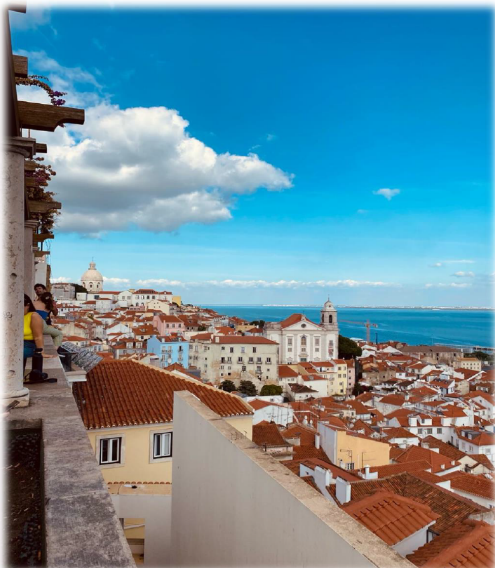
My favorite viewpoint – Miradouro de Santa Luzia

was more exciting. My internship lasted almost 4 months, from the 15 th of October 2023 until the 30 th of January 2024.