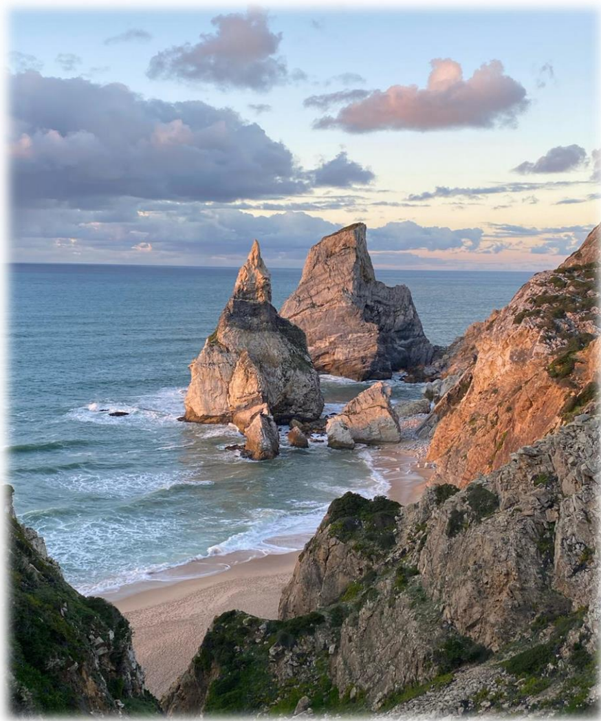
Praia da Ursa. A day trip with my friends.

In my free time, when I was not working, we would go on excursions or trips with my friends or join some ESN events. We went on trips such as Madeira and Azores which I highly recommend to anyone who will go to Portugal. On the weekends we would always meet up and go either to some Bar in Bairro Alto, where students used to hang out, or to a club. Regarding my daily life, I mostly used to work during the day and go out at night. The transportation was not the best if you were not living somewhere close to the metro. The busses used to not come on time and also take very long during the rush hour from 17:00 to 20:00. On the other hand, we used to use Bolt a lot since it was very cheap and sharing it was very worth it. If you are living in the center the distances are not very big, but the way can be difficult since Lisbon has many uphill and downhill.